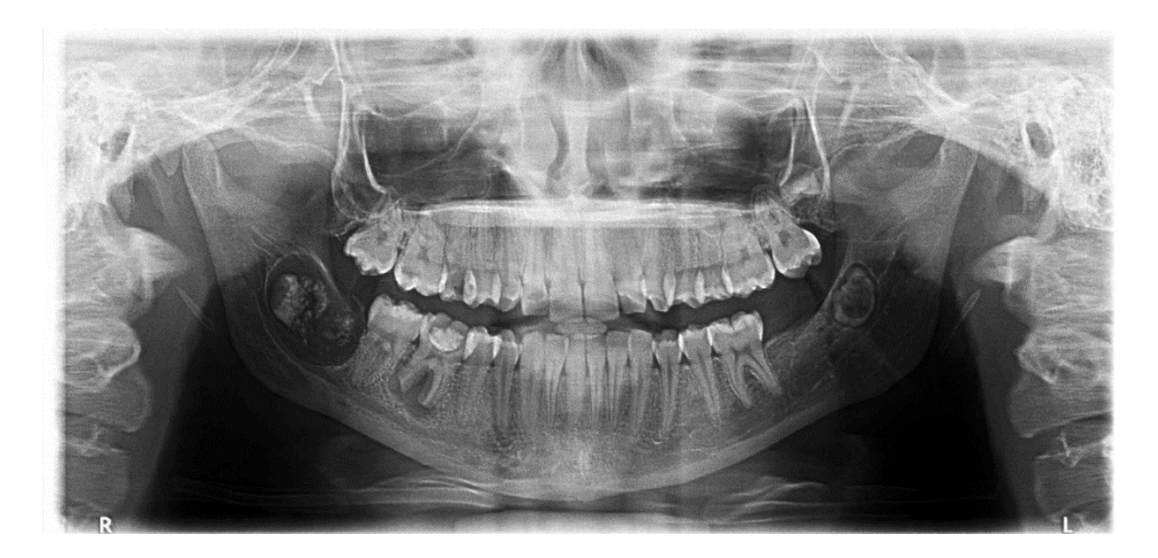
Figure 2. Panoramic radiography. Right image: unilocular, radiolucent lesion with well-defined borders. Radiopaque foci inside the lesion. The lesion caused narrowing of the mandibular canal on the right. Left image: unilocular, radiolucent lesion with well-defined borders. Radiopaque foci inside the lesion.

The treatment of choice was enucleation (Figure 3), followed by curettage of the bone defect. The removed material was sent for anatomopathological analysis (Figure 4). Histopathological examination of the hematoxylin/eosin-stained specimen revealed the presence of tooth-like structures formed by a matrix of enamel and dentin, as well as regions containing dental papillae. These findings confirmed the diagnosis of complex odontoma (Figure 5). The patient was also referred for endodontic treatment of tooth 46. She has been under follow-up for 6 months and there were no signs or symptoms of recurrence of lesions in the mandibular ramus, however, she refused to perform the treatment of the periapical lesion in 46 and new lesions appeared carious in elements 15 and 12 (Figure 6).