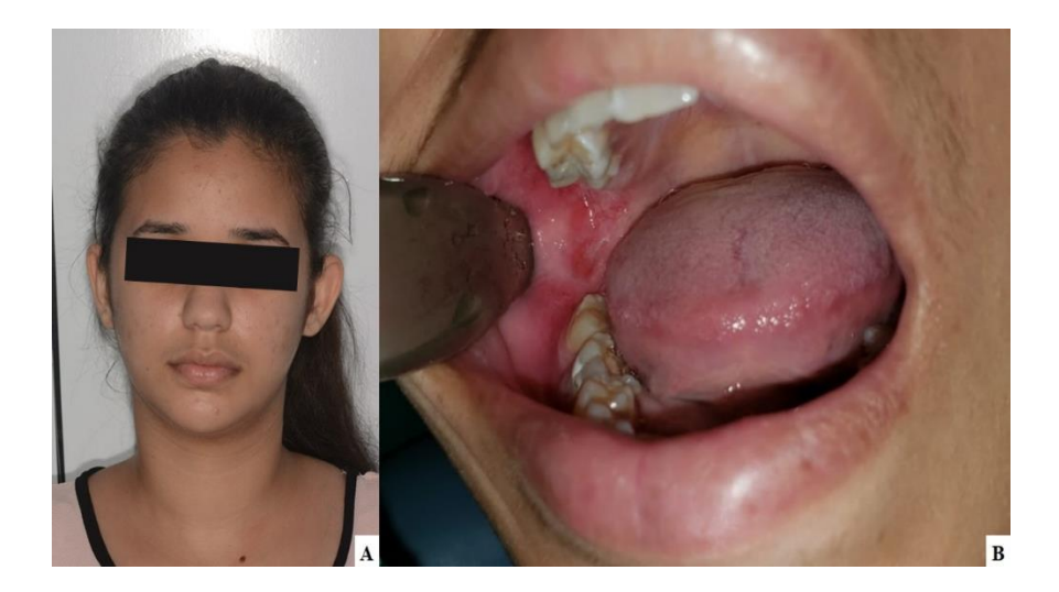
Figure 1. Initial clinical appearance. A) Extraoral view. B) Intraoral view.

A 16-year-old girl was sent to an oral-maxillofacial surgery referral service because of a lesion detected by routine radiography. The imaging exam had been performed 30 days earlier and the duration of the lesion was unknown. During anamnesis, the person responsible for the patient reported that she had been exhibiting mental/behavioral agitation since age 7 after she had developed a headache followed by the loss of balance. However, despite seeking specialist services, no diagnosis could be established that would explain her alterations. Extra- and intraoral physical examination revealed no noteworthy alterations (Figure 1A and 1B).