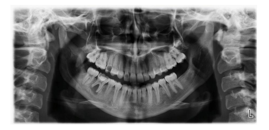
Figure 6. Control panoramic radiograph showing the absence of recurrence.

Figure 5. Histopathological features (hematoxylin-eosin). A) Different degrees of mineralization of dentin. Pre-dentin (arrow) and mature dentin (asterisk) (200×). B) Dental papilla (asterisk) (200×). C) Enamel matrix (asterisk) (200×). D) Cementum-like area containing cementocyte lacunae (arrow) and islands of ameloblastomatous epithelium. Note the inverted polarization at the periphery (asterisk) (200×).