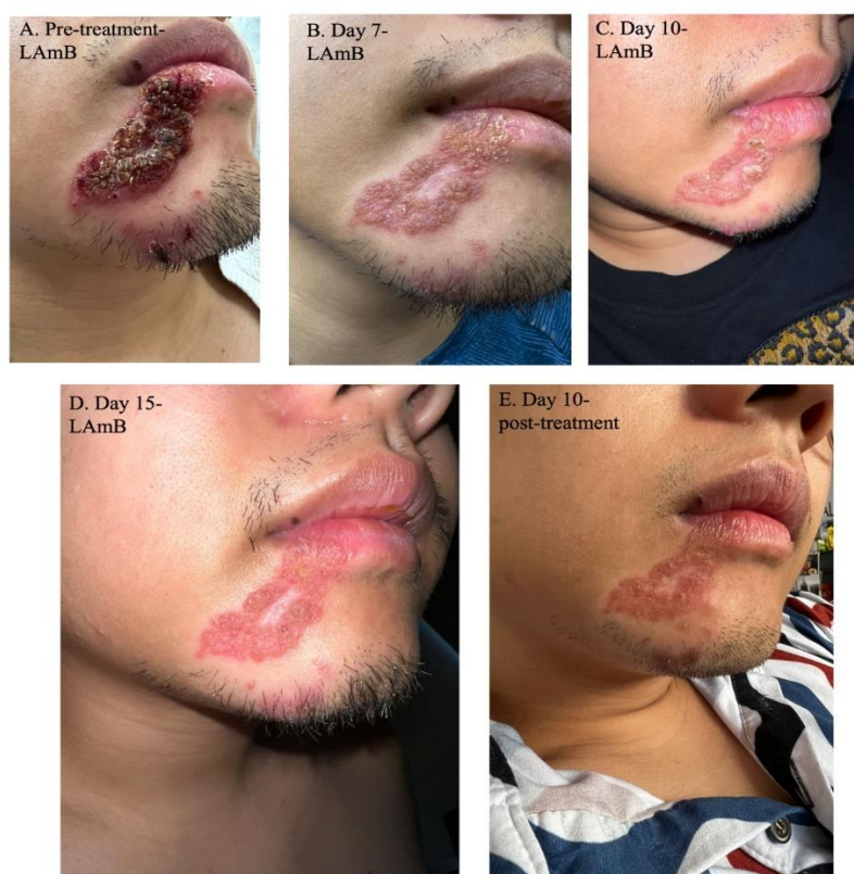
Figure 3 (A-E). The clinical evolution of this patient's lesions during and after the administration of liposomal Amphotericin B (LAmB). Note improvement in the patient's mucocutaneous lesions and disappearance of meliceric crusted lesions.